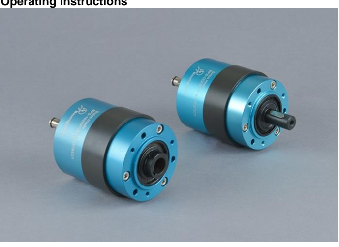
May be used for ex-zones 0, 1, 2, 20, 21, 22

According to attached declaration of incorporation of the motor and the EC type-examination certificate of the sensors. The integrator has to apply in minimum the following directives and standards: 2014/34/EU, DIN EN ISO 80079-36.